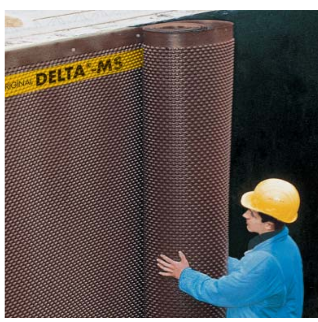
Easy to install, DELTA®-MS safely protects foundation walls.